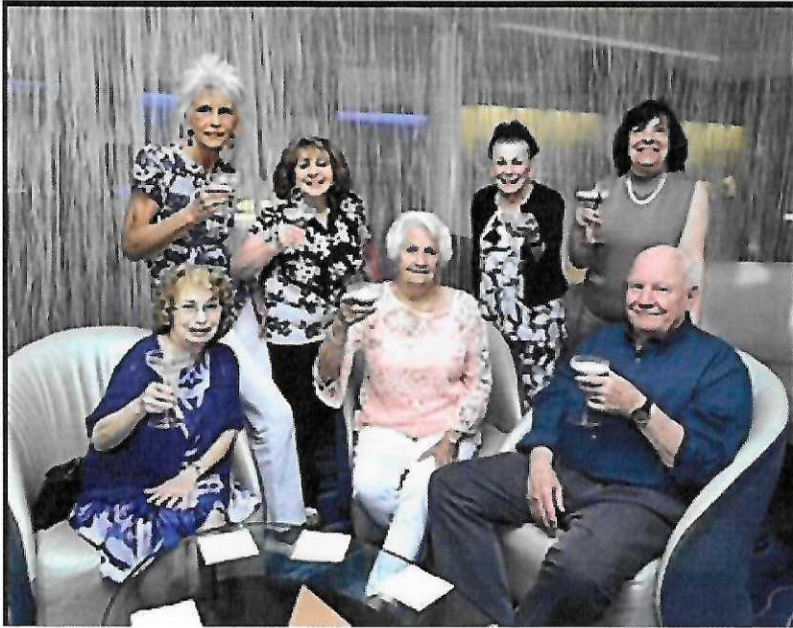
FAMILY GET TOGETHER