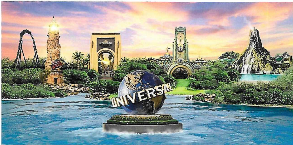
Chart a New Course at Universal Terra Luna Resort.

This new hotel is another world in Universal Orlando accommodations. Inspired by the thrill of exploring the unknown, its ultra-modern and surreal design evokes visions of an entire solar system of colorful worlds, shifting and changing as they orbit their sun. A new way to stay, it also offers Universal's great service and exclusive theme park benefits