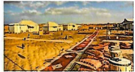
LUXURY, SAND, & SAHARA MAGIC