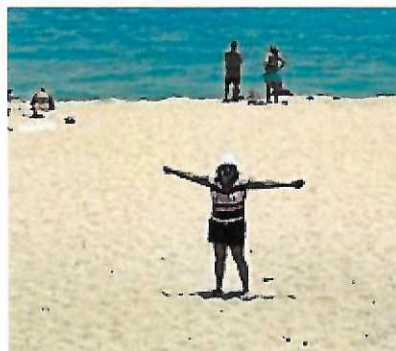
PINK SAND BEACHES