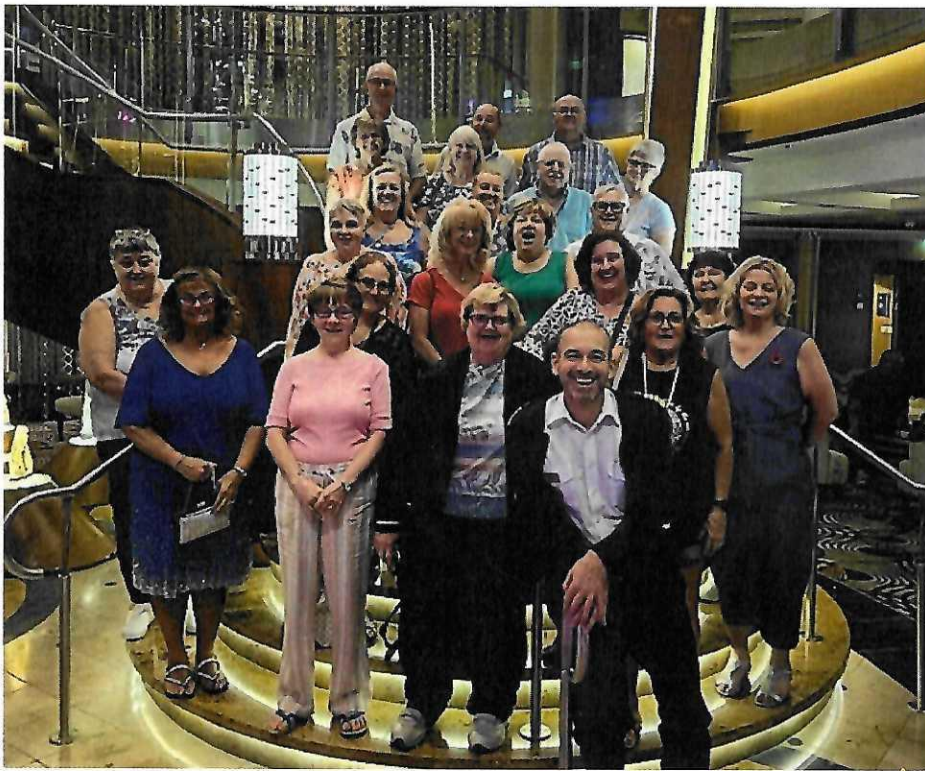
Tamaqua Group in Reflection Dining Room