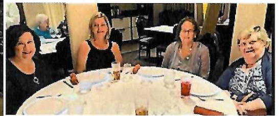
Cocktail Party at Cellar Masters