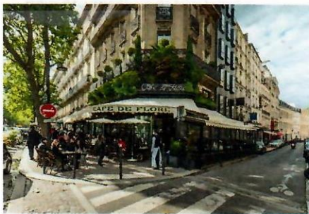
France Has Reopened to U.S. Travelers—Here's Everything You Need to Know

American Airlines brought in $1.24 billion in baggage fees in 2018, the highest among the U.S. carriers. United was second-highest with a total of $933.3 million, with Delta coming in third at $817.1 million collected.