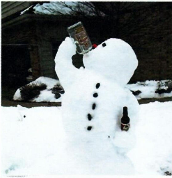
LOCAL WINTER SNOWSTORM