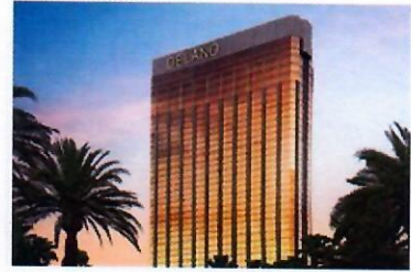
Delano Las Vegas