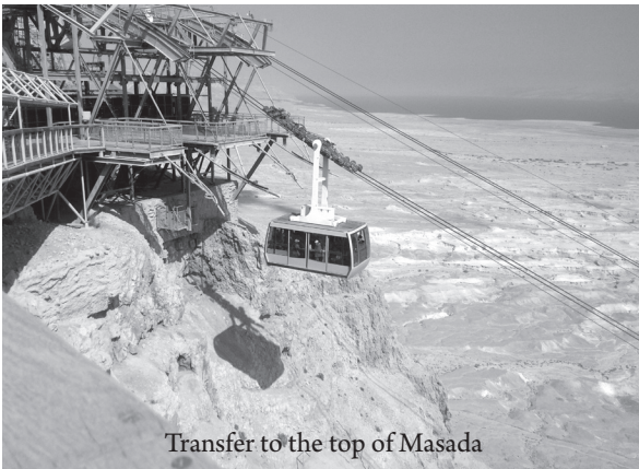
Transfer to the top of Masada