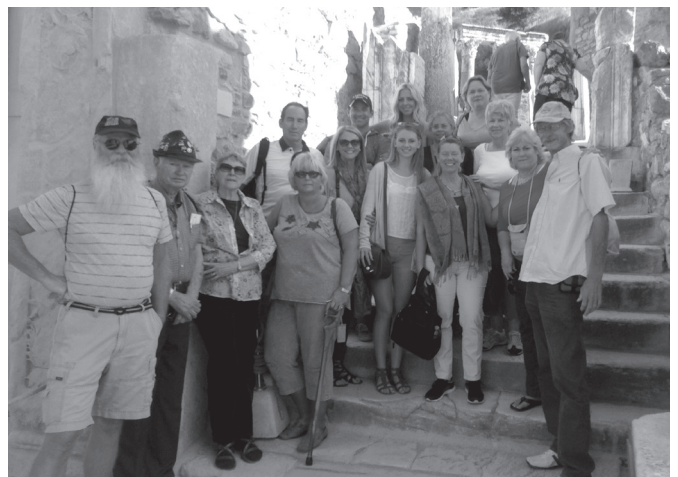
The Chase Family at the ruins of Ephesus in Turkey.