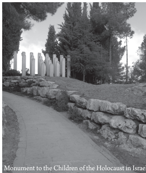
Monument to the Children of the Holocaust in Israel